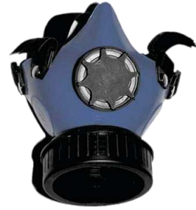
RESPIRATOR SINGLE SABS RS005