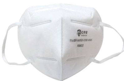
DUST MASKS FFP2 KN95 (30) EP007