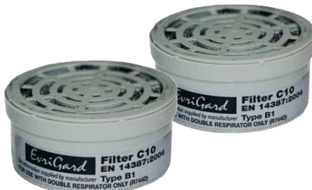
CARTRIDGE B1 (PAIR) For inorganic vapours & acid gases. RS007