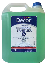
HAND SANITISER BULK 5L DCHAND5L