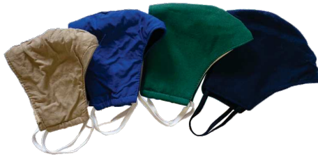
REUSABLE FACE MASK (UNIT) Washable. Various Colours Plain: WMASK Plain Dbl Layer: DMASK