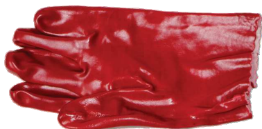
GLOVES RED 27cm OPEN CUFF One size fits all. G014-P