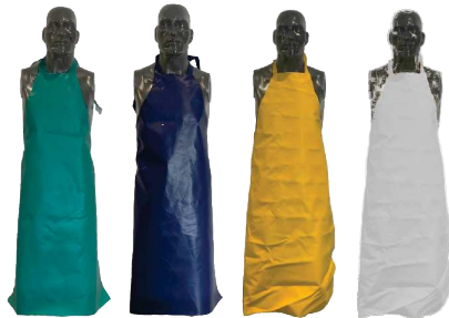
PVC APRON HEAVY DUTY Green, Blue, Yellow, White Colours. PVC-APRON-HD