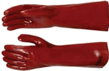
GLOVES BROWN 40cm OPEN CUFF One size fits all. G015