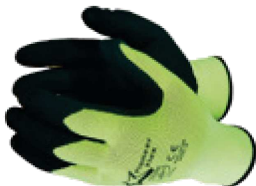
GLOVES (NITRILE) SANDY PALM One size fits all. G100