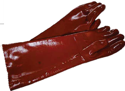
GLOVES BROWN 45cm OPEN CUFF One size fits all. G017