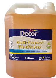
DISINFECTANT BULK 5L DISIN5L