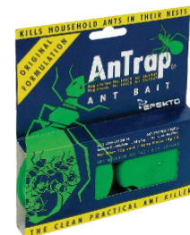
ANTRAP 2 x 10G ANT001