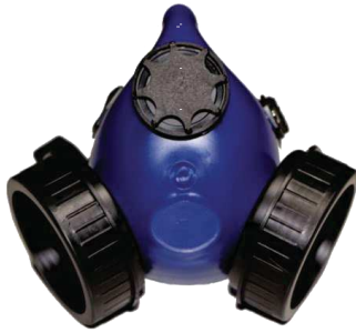
RESPIRATOR DOUBLE SABS RS002