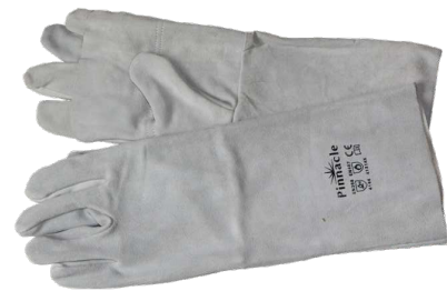
GLOVES 8" CHROME LEATHER DOUBLE PALM ELBOW 20cm. One size fits all. G006