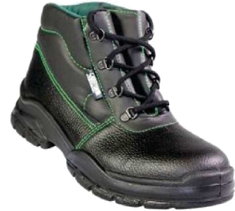
SAFETY BOOTS SABATON (SA) STEEL TOE CAPPED Sizes: 5-13 9002