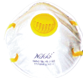
DUST MASKS FFP2 WITH VALVE (20) EP006-1