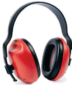
EAR MUFF RED UNIVERSAL EP002