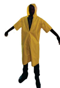
RAIN CAPE HEAVY DUTY Elbow length arms. To Order. Sizes: S/M/L/XL/2XL/3XL RKHD