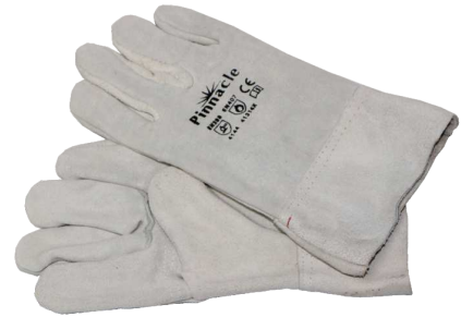
GLOVES 2.5" CHROME LEATHER DOUBLE PALM WRIST 6cm. One size fits all. G030