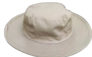
FLOPPY HAT Various Colours. Sizes: S/M/L/XL HAT