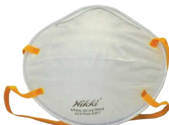
DUST MASKS FFP1 (20) EP004