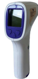
CONTACTLESS THERMOMETER THERM04