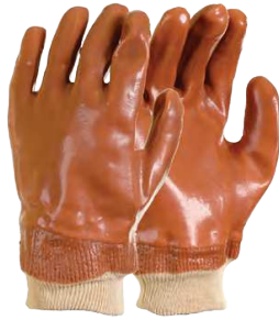
GLOVES BROWN KNIT WRIST STD One size fits all. G013-B