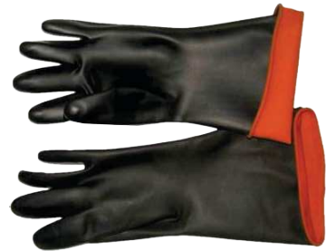
GLOVES INDUSTRIAL RUBBER 35CM One size fits all. G042