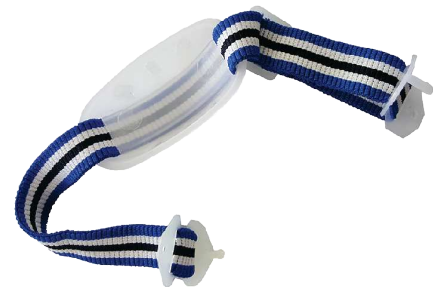
CHINSTRAP ELASTIC TWO POINT For hard hats. CHIN02