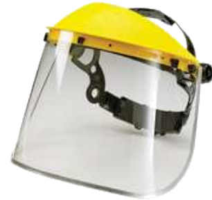
FACE SHIELD CLEAR COMPLETE WH007