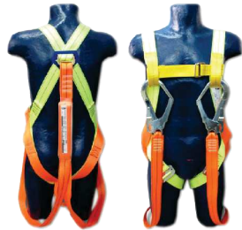
HARNESS DOUBLE LANYARD SHOCK ABSORBER WITH SCAFFOLD HOOK One size fits all. A030