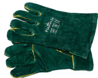
GLOVES 2.5" GREEN LINED WRIST LENGTH 6cm. One size fits all. G023