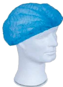
DISPOSABLE HAIR NETS (100 pack) One size fits all. HNET