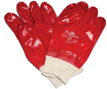
GLOVES RED KNIT WRIST PINNACLE One size fits all. G013-P