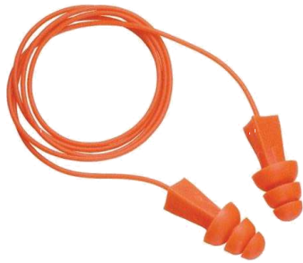
3-FLANGE EAR PLUGS PLASTIC CORDED EP001