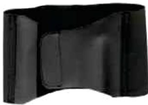
BELTS ELASTICATED KIDNEY Sizes: S/M/L/XL/2XL A034