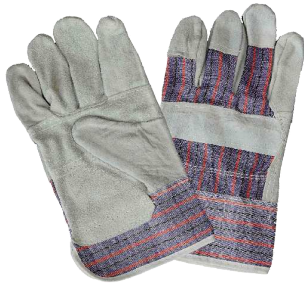
GLOVES CANDY STRIPE CHROME LEATHER One size fits all. G002