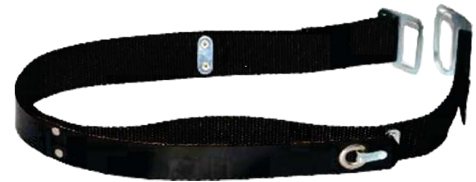
BELTS CAP LAMP Sizes: S/M/L A035