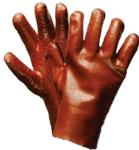
GLOVES BROWN 27cm OPEN CUFF One size fits all. G014