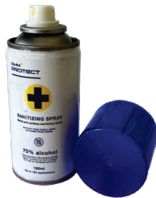
HAND SANITISER SPRAY 120ML DCSaniSp