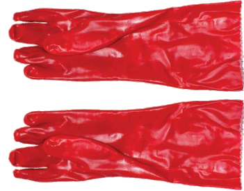
GLOVES RED 40cm OPEN CUFF One size fits all. G015-P