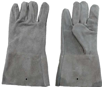
GLOVES 4" CHROME LEATHER DOUBLE PALM WRIST 10cm. One size fits all. G011