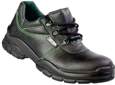
SAFETY SHOES SABATON (SA) STEEL TOE CAPPED Sizes: 5-13 9001