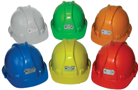
HARD HAT SABS - MINERS Blue, Green, Orange, Red, Yellow, White Colours. H003