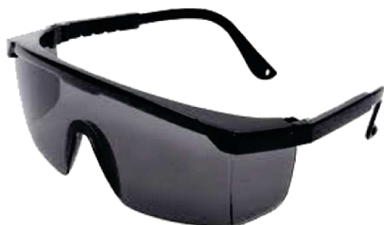
SPECTACLES TINTED ANTI-SCRATCH Safety spectacles. Grey. PV001-GL