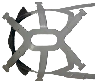
LINER 6 POINT For hard hats. LINER6