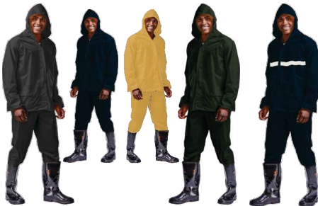
RAIN SUIT (TWO PIECE) Sizes: S/M/L/XL/2XL/3XL Black, Navy, Olive, Yellow. RS Navy, Olive, Yellow. Pioneer. RS-P Reflective Navy. RSRN