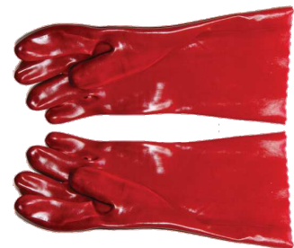
GLOVES RED 35cm OPEN CUFF One size fits all. G016-P