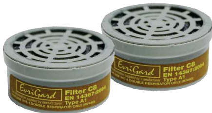
CARTRIDGE DUST A1P2 (PAIR) For organic vapours & acid gases. RS008