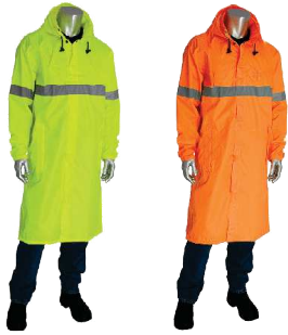
RAIN COAT HI-VIS Sizes: S/M/L/XL Lime. RC-HI-VIS-L Orange. RC-HI-VIS-O