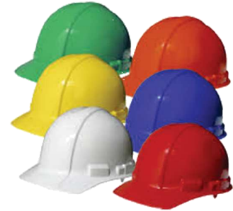
HARD HAT SABS - BUILDERS Blue, Green, Orange, Red, Yellow, White Colours. H001