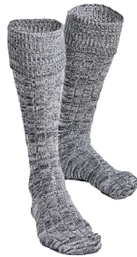
MINING SOCKS Size 6-12 MINERS SOCKS