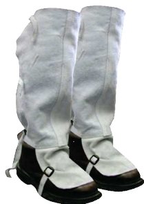
SPATS CHROME LEATHER KNEE A016