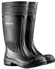
GUMBOOTS GRIPPER AGRICULTURAL Sizes: 5-12 1200