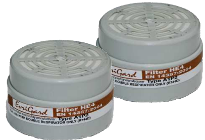
CARTRIDGE SPRAY PAINT A1 (PAIR) For organic vapour & acid gases. RS003