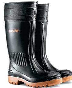
GUMBOOTS EGOLI STEEL TOE CAPPED Sizes: 6-13 1270