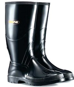
GUMBOOTS DURALIGHT BLACK Sizes: 5-12 1040