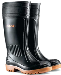
GUMBOOTS EGOLI PLAIN Sizes: 5-12 1260