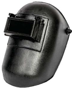
WELDING HELMET FLIP FRONT WH001