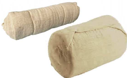
MUTTON CLOTH 500g Roll MC500 1000g Roll MC1000