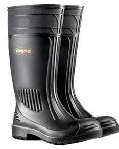
GUMBOOTS GRIPPER STEEL TOE CAPPED Sizes: 4-12 1210