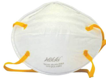
DUST MASKS FFP2 (20) EP005