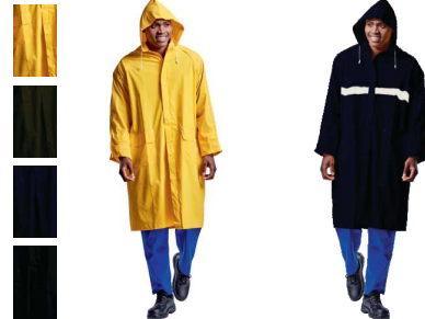
RAIN COAT Sizes: S/M/L/XL/2XL/3XL Black, Navy, Olive, Yellow Colours. RC Black, Navy, Yellow Colours. Pioneer. RC-P Reflective Navy Colour. RCRN