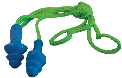
3-FLANGE EAR PLUGS COTTON CORDED EX-05B