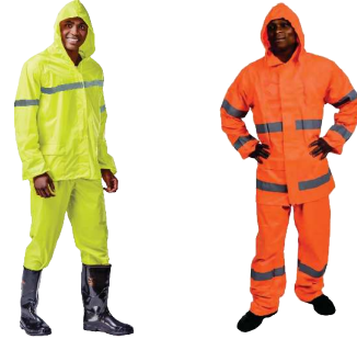
RAIN SUIT HI-VIS Sizes: S/M/L/XL/2XL/3XL Lime. RS-HI-VIS-L Orange. Pioneer. RS-HI-VIS-P Orange. RS-HI-VIS-O