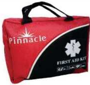
FIRST AID KIT MOTORIST COMPLETE A038