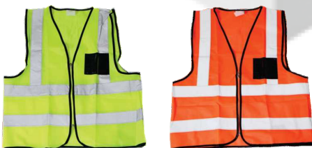
REFLECTIVE VEST With Zip and ID Pouch. (120g) Sizes: S/M/L/XL/2XL Lime: V024Y Orange: V024O