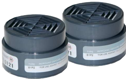
CARTRIDGE B1P2 (PAIR) For inorganic gases, vapours & particles. RS010