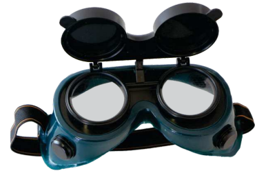
GOGGLES GAS WELDING FLIP FRONT SG002-B