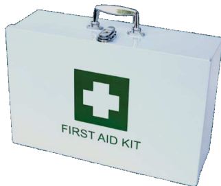
FIRST AID KIT REGULATION 7 MINING Metal Box RS009-2