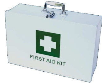
FIRST AID KIT REGULATION 3 FACTORY Metal Box RS009