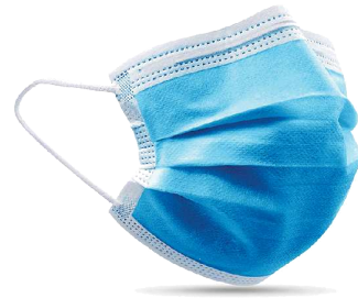
SURGICAL FACE MASK (50) SMASK