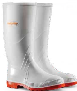
GUMBOOTS DURALIGHT WHITE Sizes: 5-13 1030