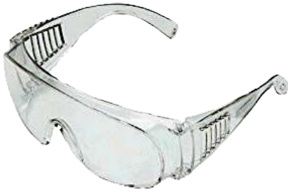
WRAPAROUND GOGGLES CLEAR ANTI-SCRATCH Safety goggles. PV002