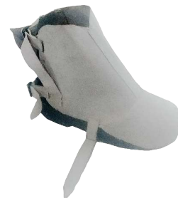
SPATS CHROME LEATHER ANKLE A017B