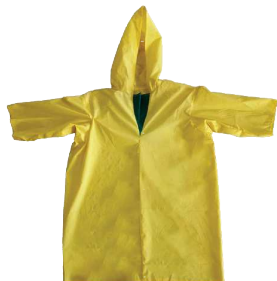
RAIN CAPE LIGHT DUTY Elbow length arms. Sizes: M/L/XL RKLD