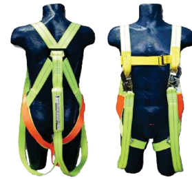
HARNESS DOUBLE LANYARD SHOCK ABSORBER WITH SNAP HOOK One size fits all. A030-G