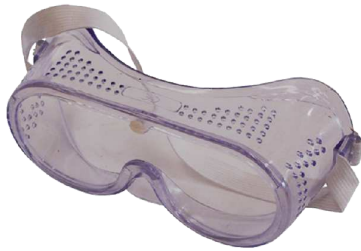
GOGGLES CLEAR GRINDING (MONO) SG001-B