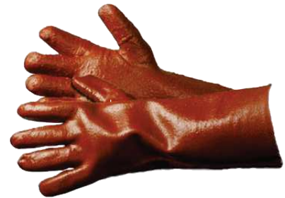
GLOVES BROWN 35cm OPEN CUFF One size fits all. G016