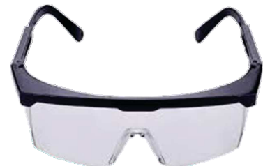
SPECTACLES EURO CLEAR WITH BLACK FRAME SG006