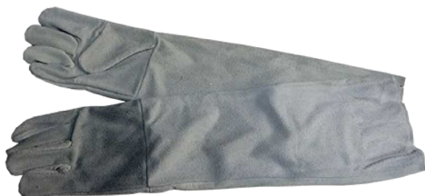
GLOVES 16" CHROME LEATHER DOUBLE PALM SHOULDER 40cm. One size fits all. G006-S